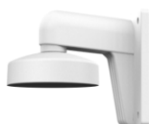
DS-1272ZJ-110-TRS Wall Mounting Bracket